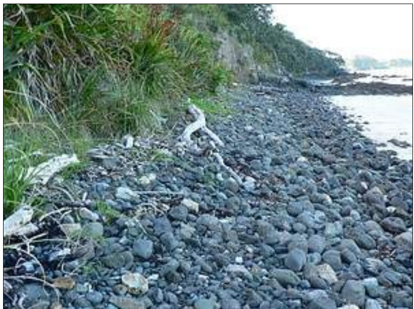
Pongaheka South beach