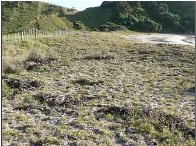
Kupe North beach