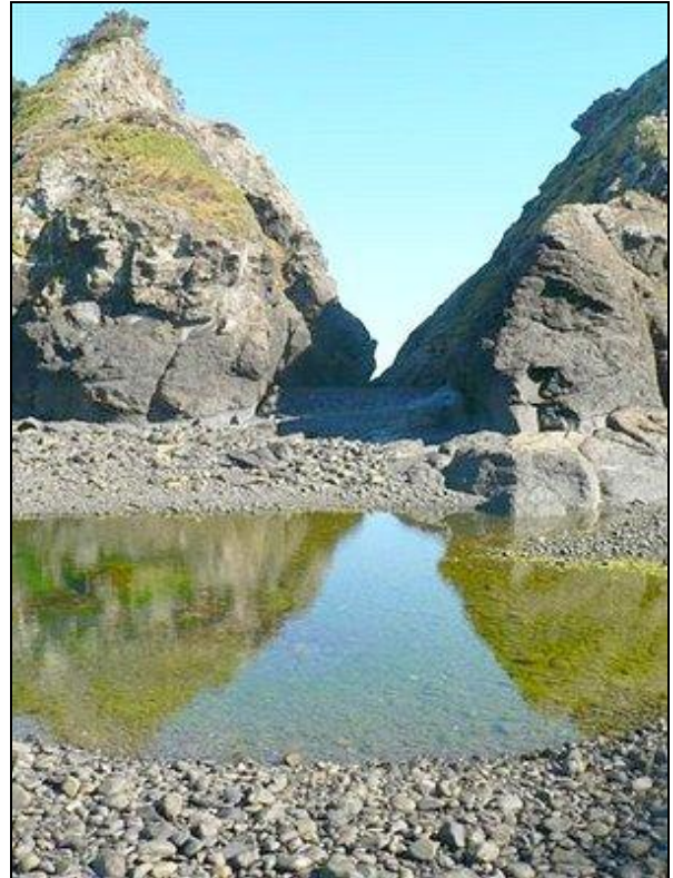
▲ Wareware Island gap. Common geckos were found under the loose rocks and boulders in the floor of the gap.