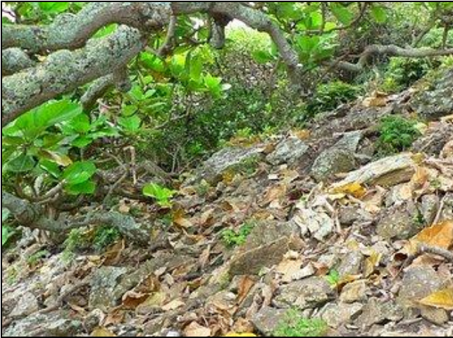
▲ Pupuha Island, southern side. Many Pacific geckos were located under the loose rubble rocks on the side of the island.