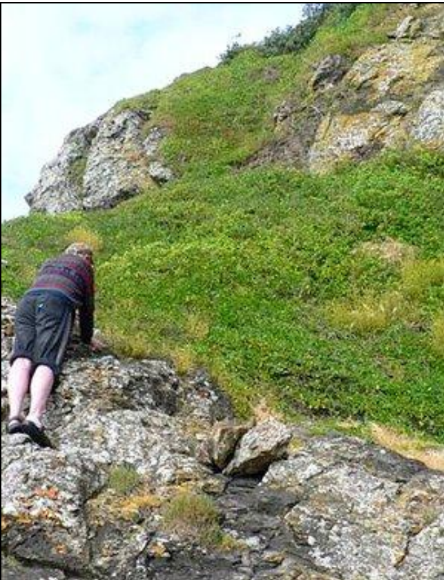
◀ Muriwhenua Island gap. This area is typical of many of the search areas. Geckos were located under small stones and larger boulders closely adherent to the shoreline rocks. Geckos were also found under rocks and stones beneath low shoreline vegetation, such as the coprosmas in this photograph, but were harder to capture in these locations.